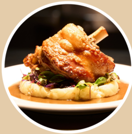
GERMAN PORK KNUCKLE